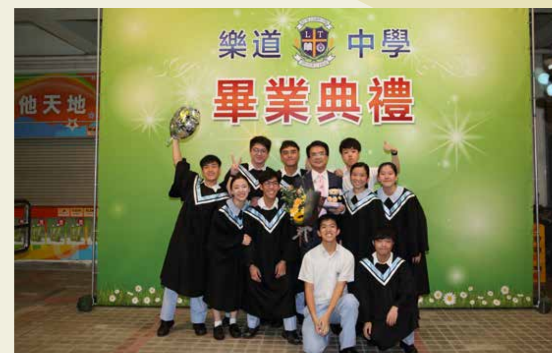
A group photo with the class teacher