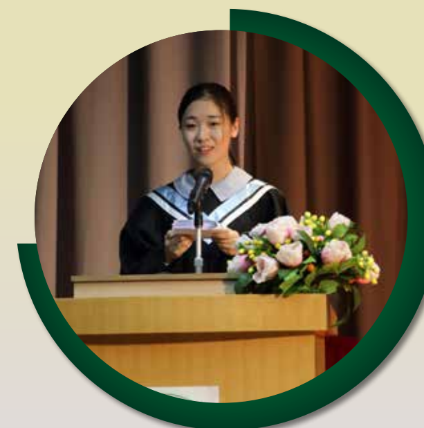
The graduate representative giving her touching graduation speech

Forget not then thine alma mater name May the passion and spirit be eternal flame Guide thee through the path with blessings and acclaim Forget not these!