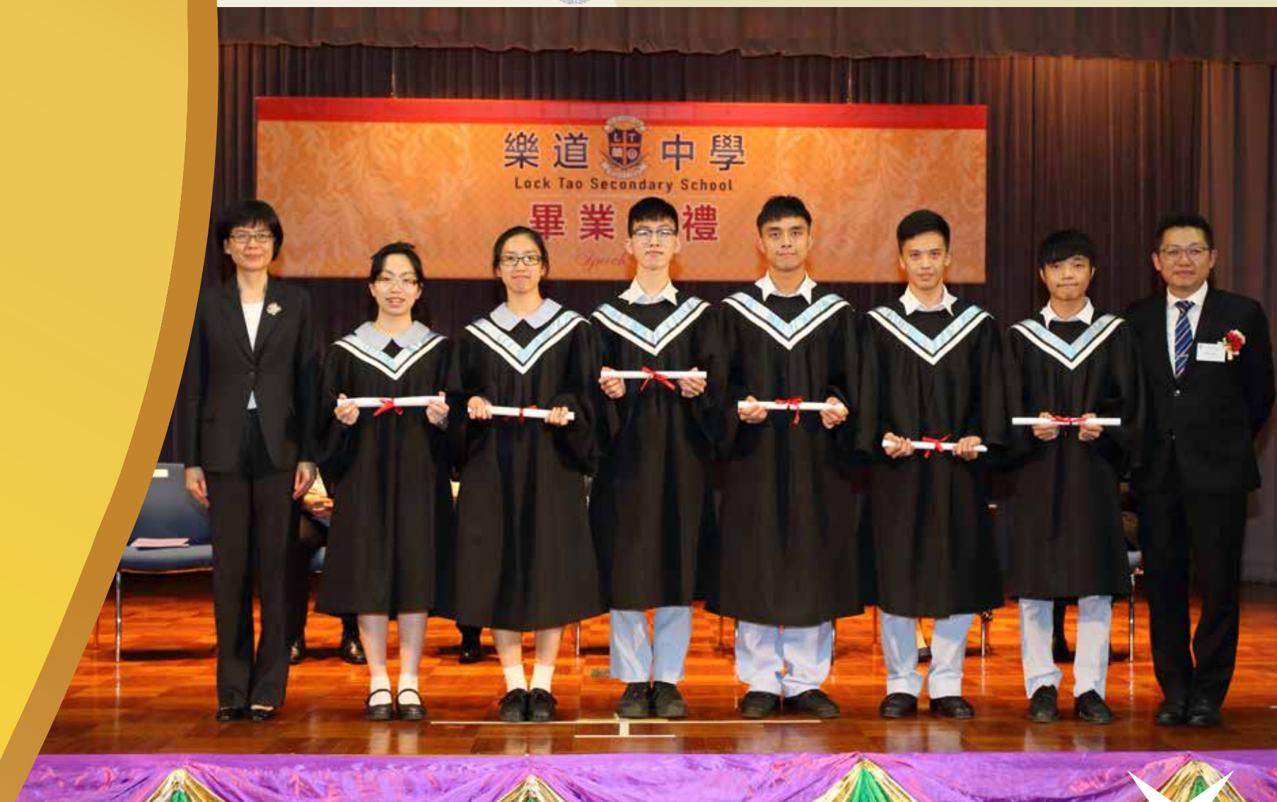
Presentation of Certificates to S.6 Graduates