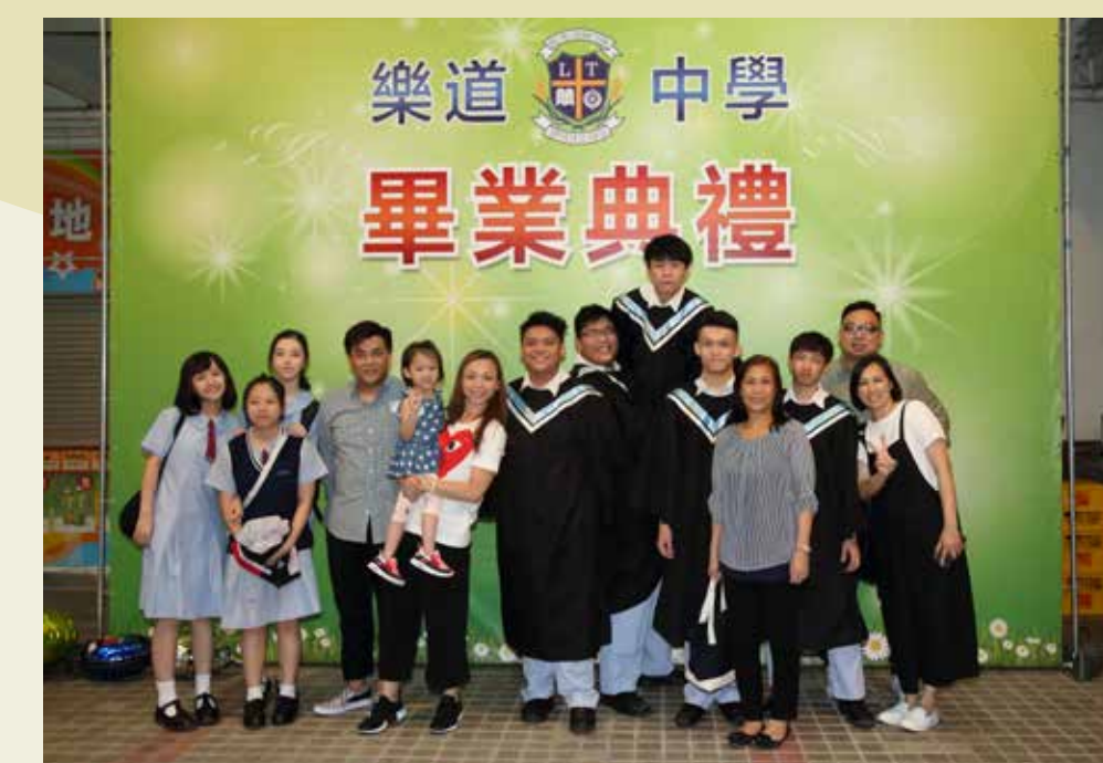
A night to remember with our beloved ones