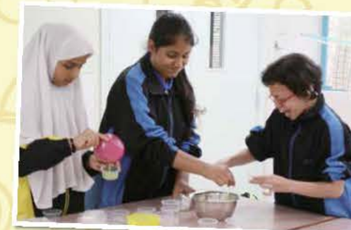
Who says learning English can't be fun? They are all wearing great smiles on the face. I can't wait to taste their dishes.