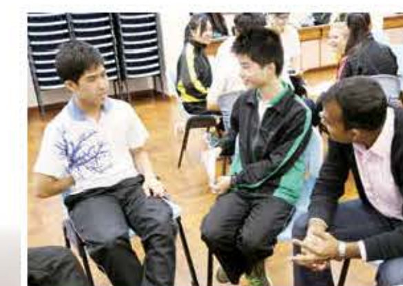
Students are practising the strategies learnt from the SCI trainers, for example, brainstorming and elaborating ideas for their presentations.