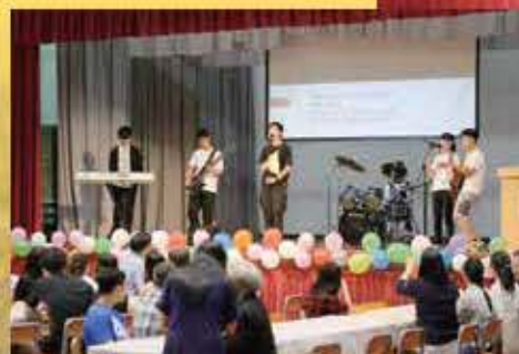
Our English Band was rocking onstage (Encore).