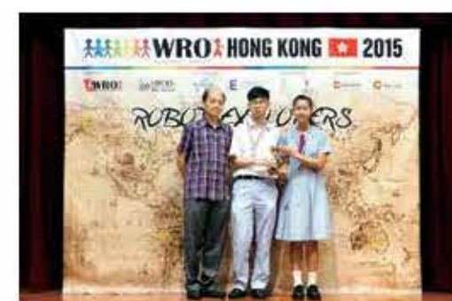
LTSS team has received a trophy and medals from the adjudicator.