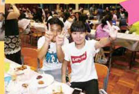
Look at our English Band members, they study hard and play hard.