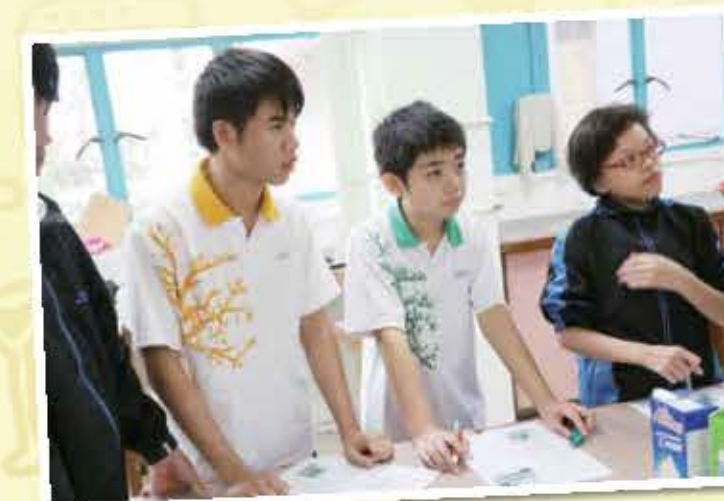
Our English Club members are very serious when they come to the learning session. You can tell from the look on their faces.

1. LTSS has several superb cooks and I would let you guess who they are.