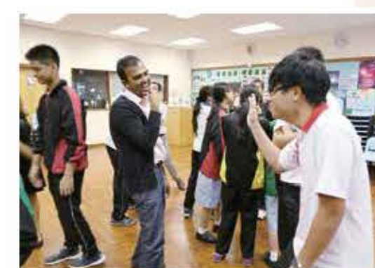
SCI trainers are playing games and chatting with the students.