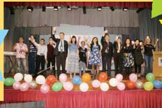
A toast to celebrate our long-time friendship and many more years to come.

We had a delightful evening meeting. We were offered fabulous desserts by the English Club and heartwarming music by the English Band. More importantly, we had a lucky draw, which reached a peak of excitement of the day. We look forward to the next PTA Annual General Meeting and Dinner Buffet, where parents and teachers can maintain a true communication and develop friendship.