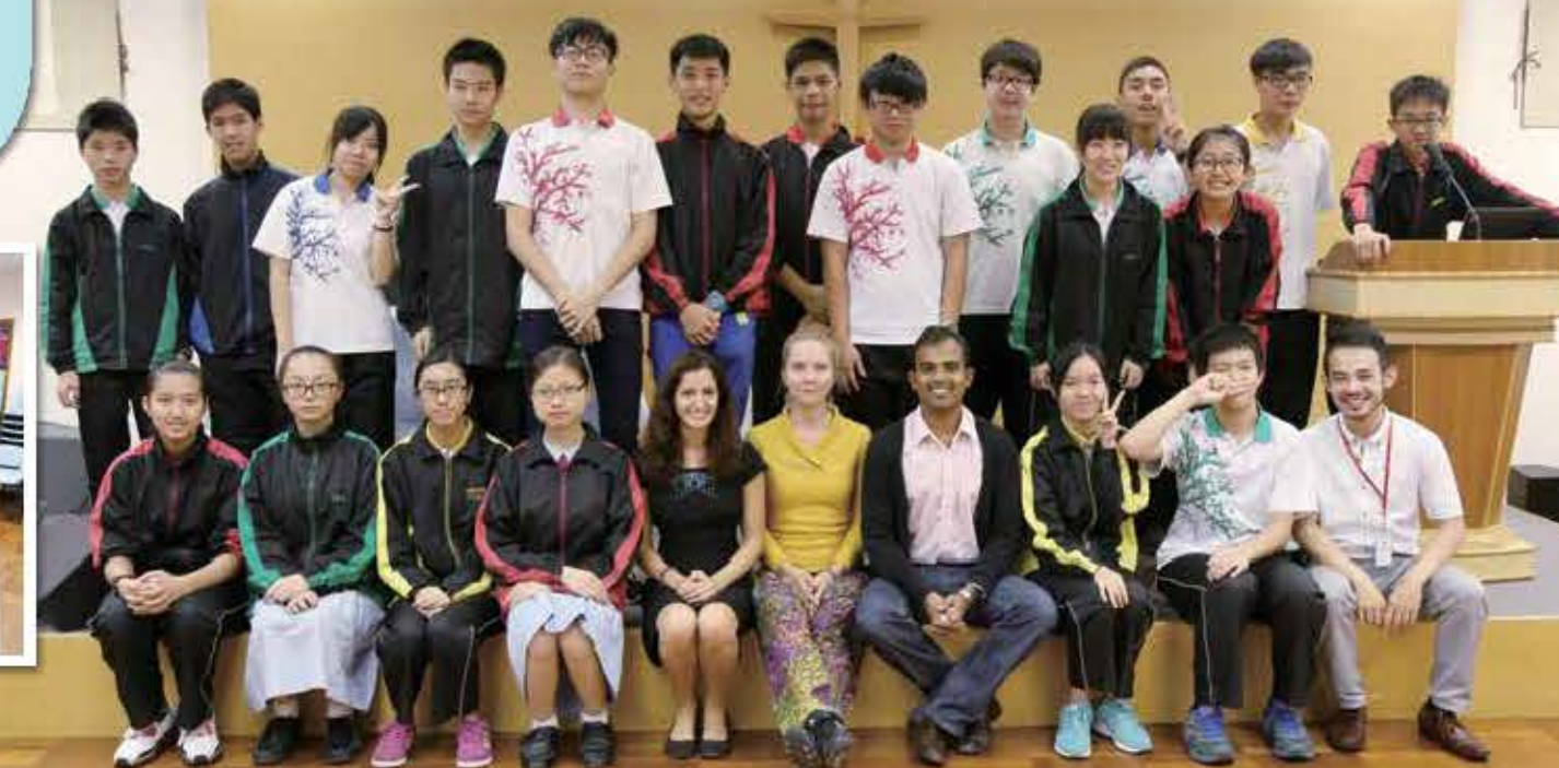
We are taking a group photo with the SCI trainers before waving goodbye.